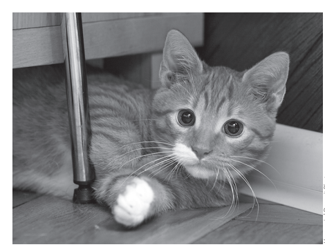
Moving to a new home can be very stressful.

any family cats show signs of stress at some point. It may be a short-term stress, which is a swiftly passing stage that may occur after a move or the addition of a new pet. But some cats show long-term stress. Stress may manifest itself as urinary marking, aggression toward people or other pets, scratching inappropriate things like furniture, or overzealous grooming leading to hair loss and possible skin lesions. Some physical ailments, such as idiopathic cystitis and chronic gastrointestinal problems, can also be stress-related.