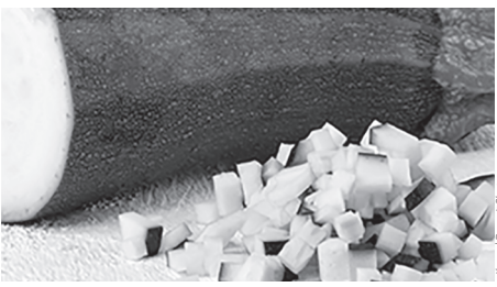
Many cats like chopped zucchini.

It's wise to cook the vegetables to liberate the nutritional density. Raw vegetables don't have any advantage except that they aren't as calorie dense.