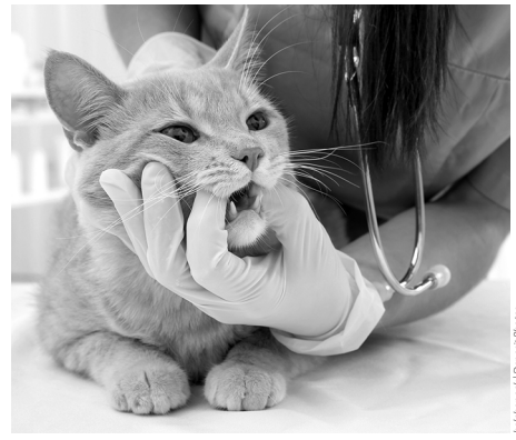
With a cooperative cat, your veterinarian can see any holes or inflammation.

While they are technically possible, true cavities are rare in companion animals. It is possible to fill holes from tooth resorption if the pulp has not yet been exposed, but the tooth will continue to be resorbed, ultimately causing the filling to fail.