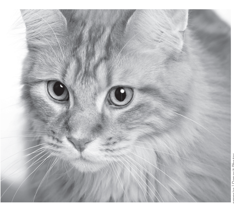
The Maine Coon is a North American breed, native to Maine and the official state cat.

machinery" of the host) and travels to the spleen, lymph nodes, intestine, urinary bladder, salivary glands, and the bone marrow in white blood cells called mononuclear cells.