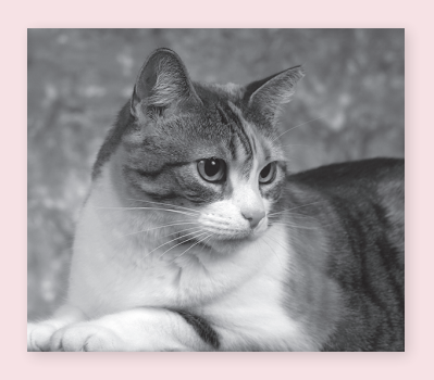
Elizabeth works with the Cornell Feline Health Center in providing the answer on this page (vet.cornell.edu/fhc/).

Cats infected with FeLV shed virus that can be infective to other cats in their saliva, urine, feces, and tears for varying periods of time, and infection of other susceptible cats occurs via the intake of virus (usually in the saliva and/or urine of another infected cat) via the oral and nasal cavity. The virus then travels to the lymph nodes in this region, and if the virus is not neutralized by an effective immune response, it replicates (makes copies of itself using the "cellular"