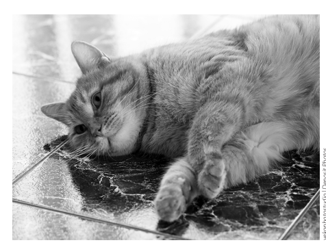
A lethargic cat is not a normal cat, and the cause needs to be investigated.

Acute pancreatitis is the common form of pancreatitis seen in dogs. This is accompanied by vomiting and severe pain. Cats tend to have a somewhat more