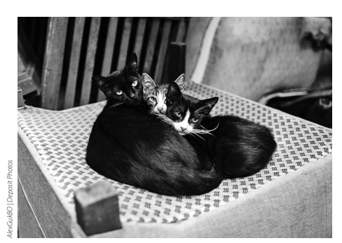
Many feline upper respiratory infections are contagious, so cats living in close proximity are at risk.

A ventral rhinotomy is considered less invasive and has a better cosmetic outcome, but there is some debate over whether or not it allows the surgeon full access to the frontal sinuses. A cat will need to eat soft food after this surgery to allow the incision to heal.