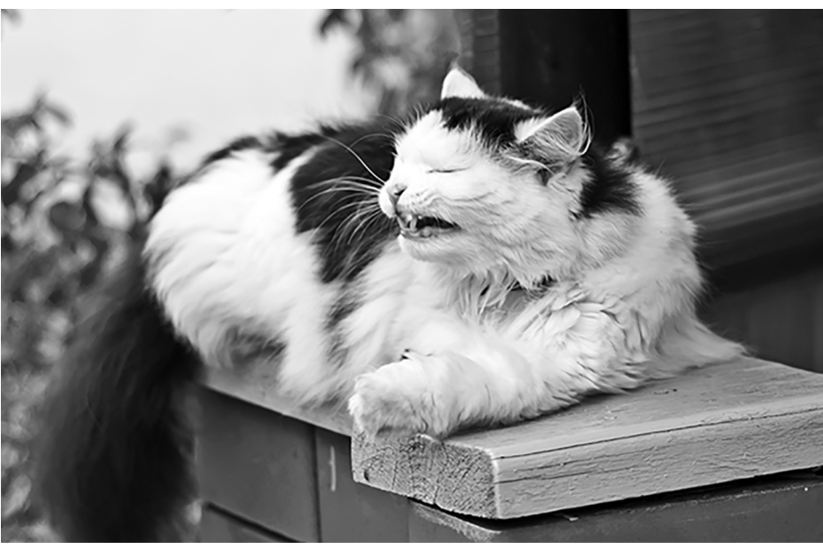
Sneezing is one of the symptoms of an upper respiratory infection, along with coughing, runny eyes, and nasal discharge.

designed specifically for use in the nasal passages. Many of these scopes also have attachments that can take biopsies and other samples. It may be possible to remove a foreign body or tumor using an endoscope. This procedure does require general anesthesia, as few cats are willing to sit still while a tiny camera is inserted up their nose. If rhinoscopy is not available or unable to resolve your cat's nasal problems, a rhinotomy may be the next step.